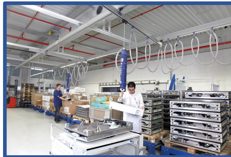
Track System & Vacuum Lifter