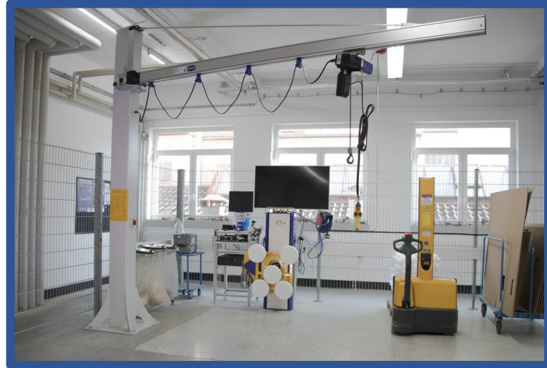
Jib Crane & Hoist