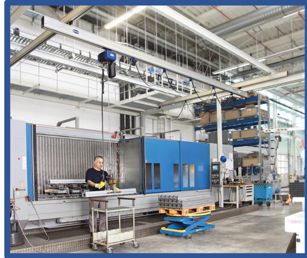
Cantilevered Track & Hoist