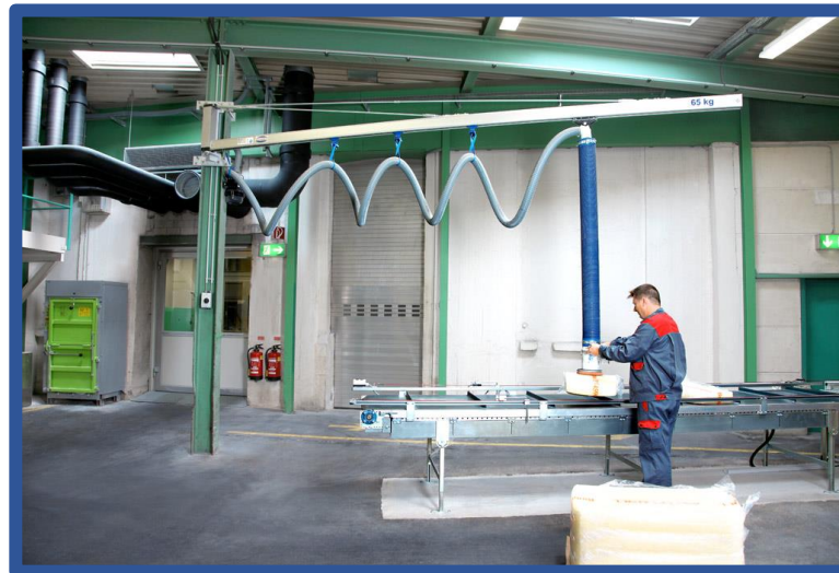
Column Mounted Jib Crane